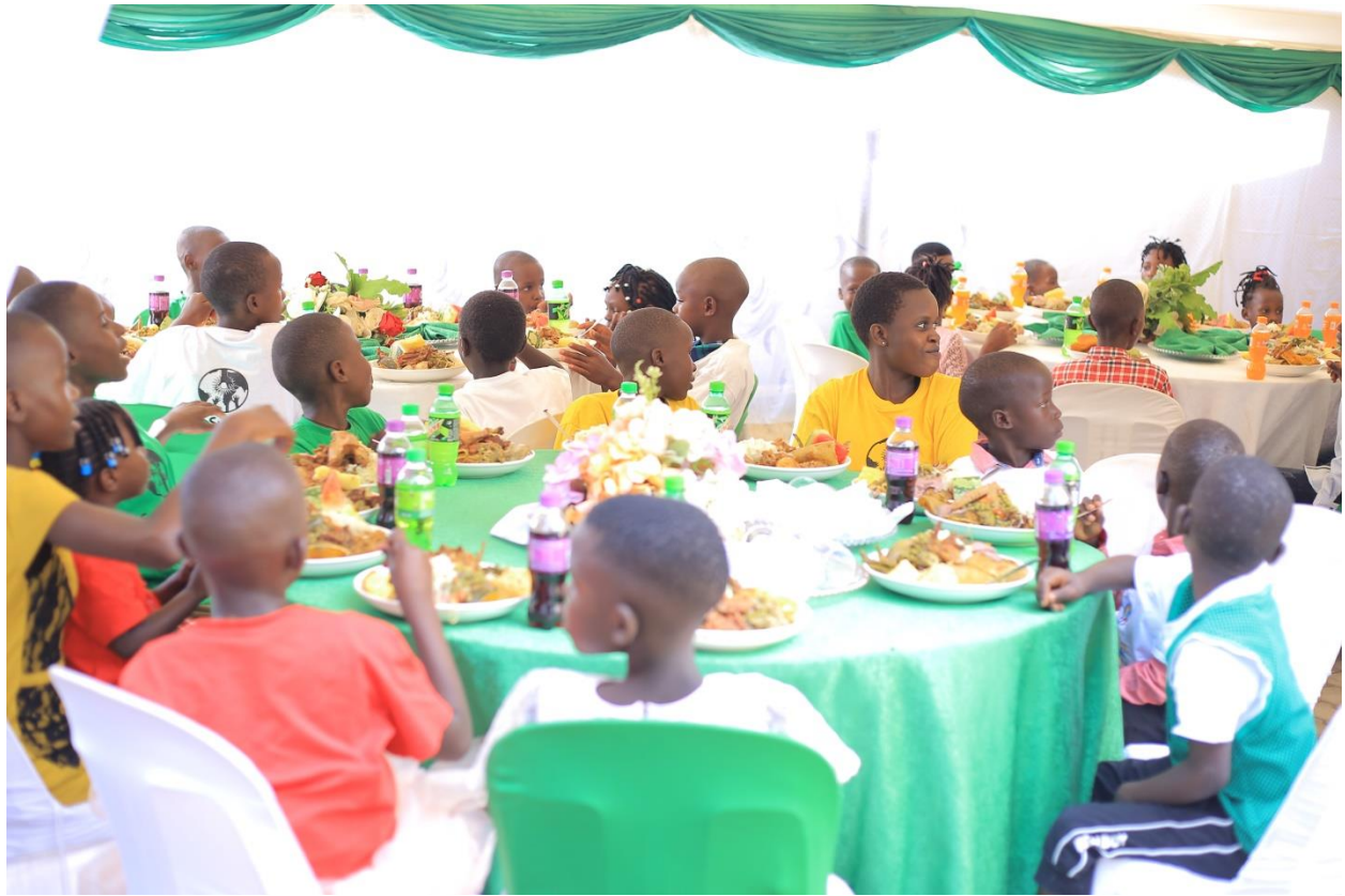
(a) Christmas Party for Shelter Children

Christmas 2024 was celebrated joyfully, with two parties organized for the street children due to the large number of attendees. Over 200 street children joined the festivities, along with staff who actively participated. Unlike previous years, where children entertained guests, this time the staff sang for the children, creating a special moment for everyone. The occasion was a great success, and children who excelled in behavior change were recognized. We hold a shelter Christmas party for all shelter children and the teen mothers. Unfortunately, we were unable to provide Christmas gifts this year due to limited funds, but we hope to resume this tradition next year.